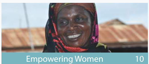
Empowering Women 10