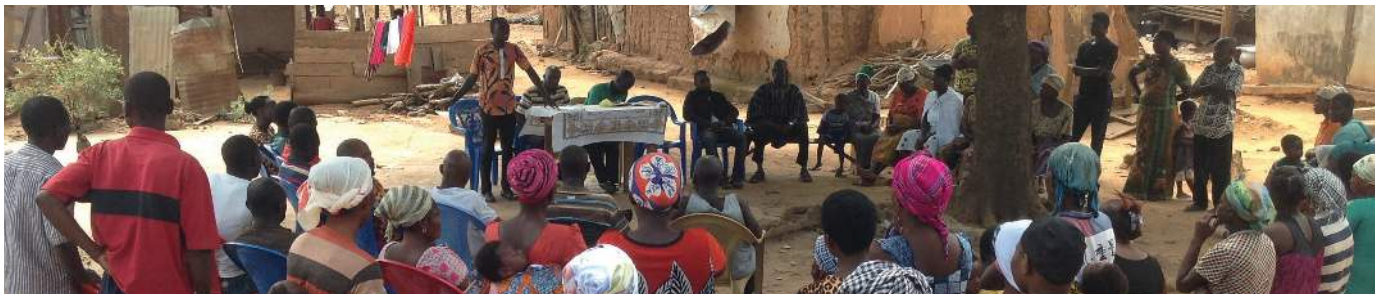
Families gather under a mango tree in Beposo to learn how to enroll in the nutrition intervention on February 23rd, 2018

Over the past two years, Self-Help staff members have measured the heights and weights of the students who are receiving breakfast porridge made from Quality Protein Maize (QPM) through the Self-Help school-feeding program when school is in session. In some communities, as many as 1 in 4 students' growth is already stunted when they start school. The children are not only short in stature, but stunting affects their ability to learn and long-term productivity for the rest of their lives that cannot be overcome by better feeding later in childhood or adulthood.