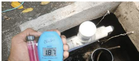
Clean water program officer, Orlando, makes a random visit to sample the water in the chlorination system