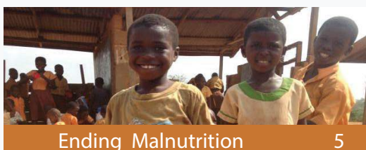
Ending Malnutrition 5