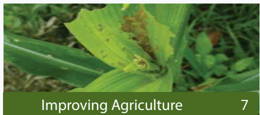
Improving Agriculture 7