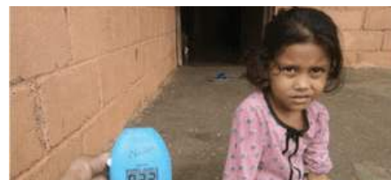
Children in La Reforma are now drinking clean water everyday