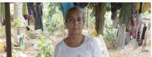
Providing Access to Clean Water 14