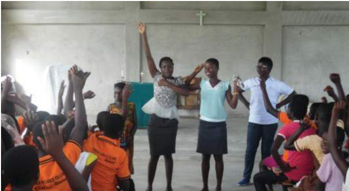
Asking questions during women's health training

Self-Help International Teen Girls Club has been helping teen girls stay in school and complete their formal education since September 2016. Since unplanned pregnancies are a leading cause of girls dropping out of school, and often dooms them to a lifetime of rural poverty, Self-Help has been leading workshops for the Teen Girls Clubs on topics requested by the participants, their mothers, and community leaders such as reading, community clean up, citizenship, and reproductive health education. The basic education initially offered was insufficient for some young women, and women of all ages in the villages we serve began asking for more comprehensive family planning services. We knew that women's health was critical to the health of the whole family – particularly if they're the only breadwinner and only earn income on days they're healthy enough to work – yet the medical knowledge required was beyond our areas of expertise. We needed a partner who could offer high quality education and affordable healthcare services by trained health professionals.